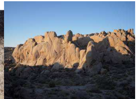
Jumbo Rocks area