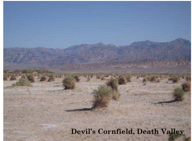
Devil's Cornfield, Death Valley

Other points about the parade: The staging area is for parade vehicles only. Porta Potties are available. Parade goes on rain or shine. There will be a lot of starting and stopping. Be prepared to wave and honk horns at the crowd, but still control your bike. Look left and wave at the VIP grand stands on Main St. We will wear our helmets, but do not obey traffic signals in the parade. The staging area is public school property and is a no smoking zone. Please bring flags for your bike and any other red, white, and blue decorations. Bring extra water; stay hydrated! Please email me to let me know if you will be participating in the Parade. This way I know how many to plan space for and to tell the registration desk. But, if you can come at the last minute, come anyway. siglowce@yahoo.com .